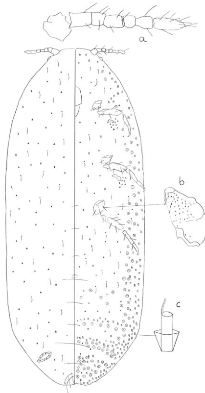
Fig. 2. Volvicoccus stipae – adult female, a – antenna, b – hind coxa with translucent pores, c – oral collar tubular duct.

the genus Mirococcopsis might be a synonym of Volvicoccus . MATILE-FERRERO (1983) suggested that Volvicoccus volvifer might be a synonym of Mirococcopsis stipae . Diagnostic characters and a key to that species are given by BORCHSENIUS 1949, TER-GRIGORIAN 1973, TEREZNIKOVA 1975, KOSZTARAB & KOZÁR 1988, TANG 1992. Illustrations are given by TEREZNIKOVA (1975) and TER-GRIGORIAN (1973).