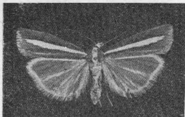
Fig. 1. Crambus radiellus (Hbn.). Tirol Stubal 2500 m Hoher Burgstall. Fig. 2. Crambus radiellus tatricellus n. ssp. Tatry Mts. Mała Swi- nica 1300 m.

lustrous, olive-brownish with shining longitudinal stripe... Palps and the tegulae always brown. Upper part of the head and thorax coloured like the palps or a little clearer, some-